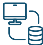
Data Center Sites