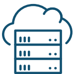
Data Providers, Holders, Aggregators