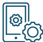
Application Development Services